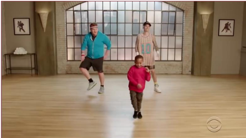
Justin Bieber Toddlerography